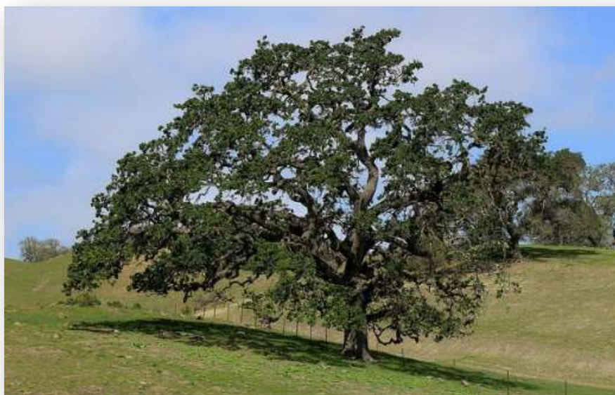
Valley Oak Youth Academy – The Valley Oak tree is native to the Sacramento area. It symbolizes lasting strength and endurance. The acorn of the tree symbolizes unlimited potential that something so small has the potential to grow into a large majestic oak tree. A tree mural is painted in the program-housing unit.

During initial orientation, a tree-focused activity identifies all the supports youth have when they enter the program. This visual tree continues to “branch” out with additional supports (e.g. family, advocates, providers, teachers, etc.) as they progress through the program. When youth leave the program, the visual reminds them they are not alone, they have support from many areas of their life, and they are growing into strong individuals capable of making healthy positive decisions that benefit themselves and the community.