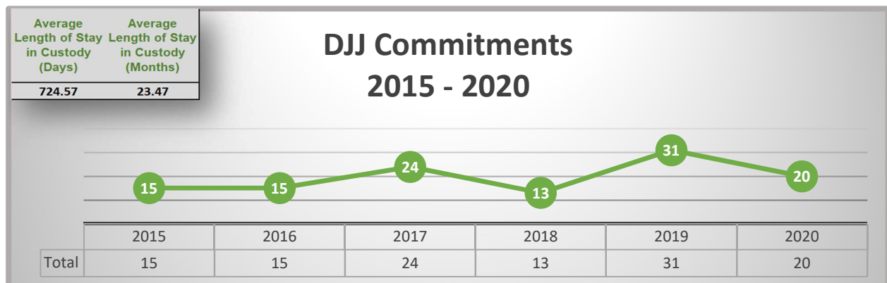
DJJ Commitments 1

VOYA secure track numbers require staffing of 10.2 staff per unit, which equates to a total of 3 housing units (approximately 50 youth) at full implementation by December 2023.