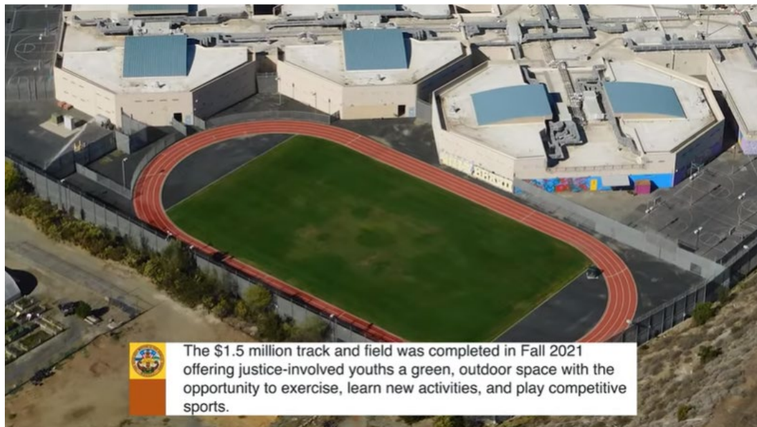
The $1.5 million track and field was completed in Fall 2021 offering justice-involved youths a green, outdoor space with the opportunity to exercise, learn new activities, and play competitive sports.

The County also recently completed the addition of a track and field at East Mesa Juvenile Detention Facility which will be available for use as part of the Youth Development Academy.